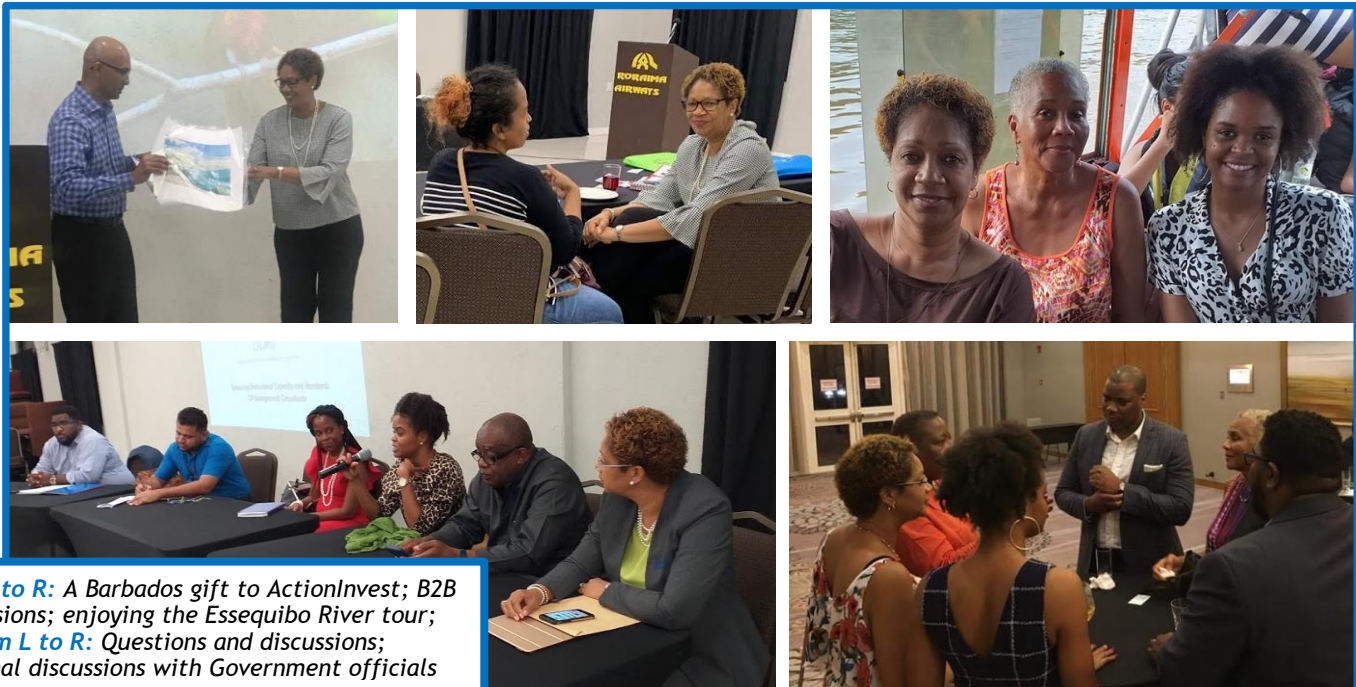
Top L to R: A Barbados gift to ActionInvest; B2B discussions; enjoying the Essequibo River tour; Bottom L to R: Questions and discussions; Informal discussions with Government officials

We welcome your feedback and suggestions for future issues of CiCMC Bites from BiM , please send us: