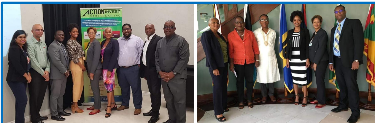
Immediate Left: Members of the Pilot Mission with the CARICOM Secretariat