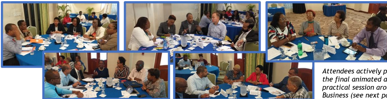
Attendees actively participating during the final animated and interactive practical session around Innovation in Business (see next page for outcomes)