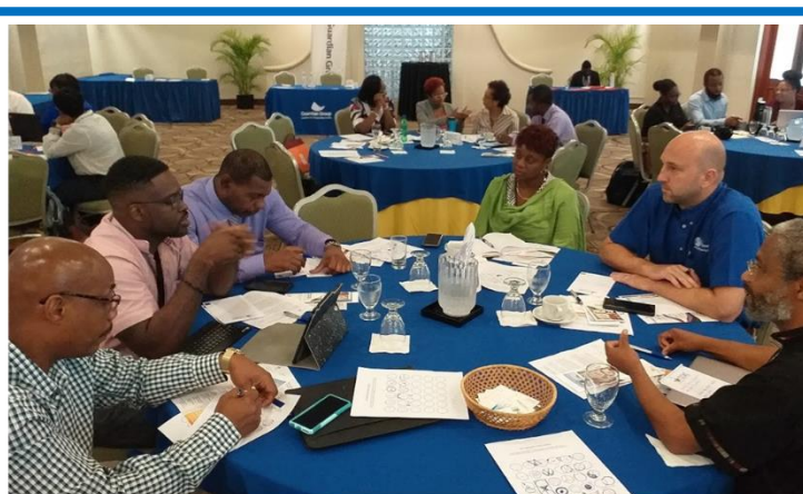
The 2019 CiCMC Imagine the Future! mini-conference attendees listening attentively