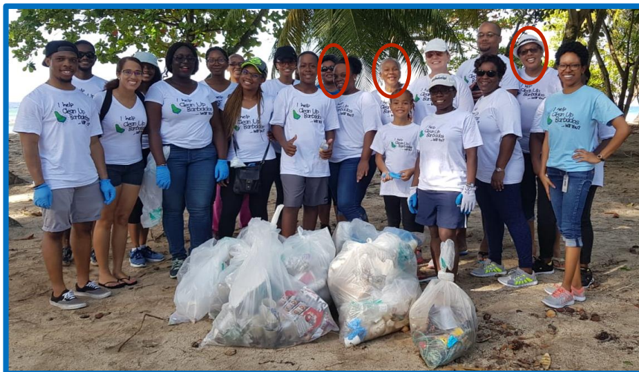
KPMG Staff group and some CiCMC members (circled) with the “fruit” of their morning’s labour