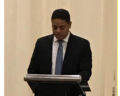
Prime Minister of Curacao, Mr Eugene Rhuggenaath, during his pre-lunch time presentation