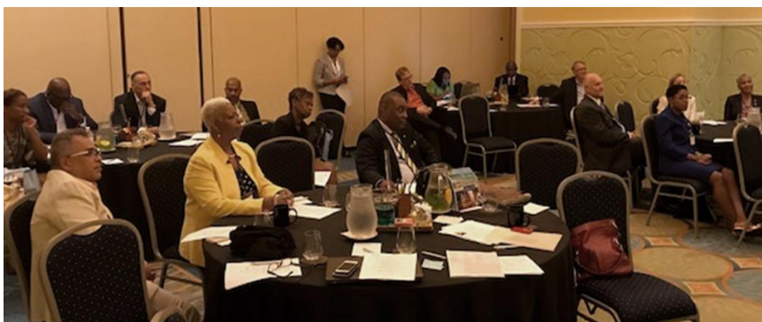
Participants in plenary session listening attentively to one of the presenters