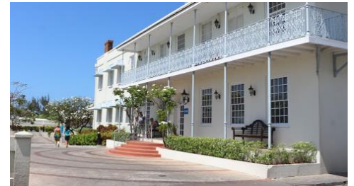
Our upcoming International Consultants Day mini-conference will be held at the Savannah hotel on June 7 th , 2018